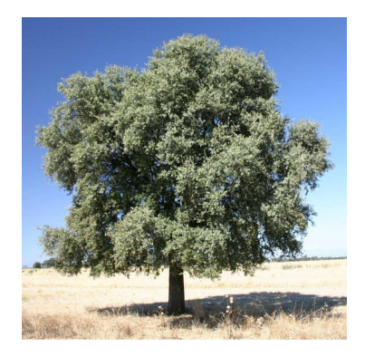
An Ilex, or Holm Oak tree.

Quercus ilex, the evergreen oak, holly oak or holm oak, is a large evergreen oak native to the Mediterranean. It takes its name from holm, an ancient name for holly.